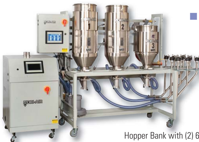
Hopper Bank with (2) 60 lb, (1) 30 LB. hopper and closed loop conveyance to three molding machines