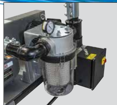
Clear dust canister shows filter status at a glance

Easy-open valves and single drain point simplify oil changes.