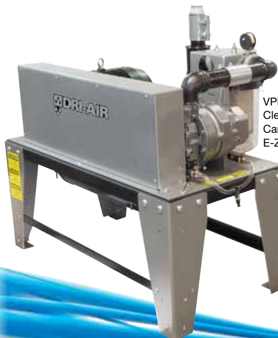
VPDB-5 with Clear View Canister and E-Z Oil Drain

Each vacuum pump is lubricated, tuned to deliver optimum vacuum and shipped fully assembled. An industrial discharge silencer is included.