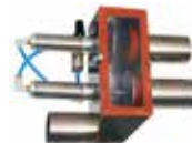
DSV Discharge Selection Valve

EPV valve with connection stub to pump for 115 VAC or 24 VDC for line diameters of 1.5", 2", 2.5", 3" and 4".