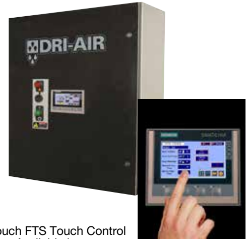
FlexTouch FTS Touch Control Available in 4" or 7" Screen Widths

The FlexTouch FTS Series is a PLC based touch screen central loading control, featuring intuitive operation in a compact, economical package. All receivers, pumps and purge valves connect to a single enclosure via discrete wiring.