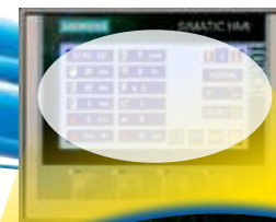
STATION SETUP 4" SCREEN

All color touch screen controls can be equipped with Ethernet capability to readily network to a PC(s) anywhere.