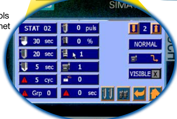
VACUUM PUMP SETUP 7" SCREEN