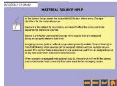
Built-in Help Pages

With the Ethernet capability of FlexXpand, all pages and all of the control's intuitive graphics can be accessed remotely on any PC. Monitor and make changes with the click of the mouse.