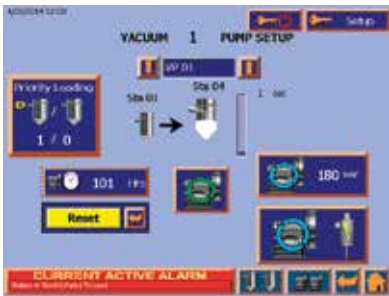
Vacuum Pump Setup