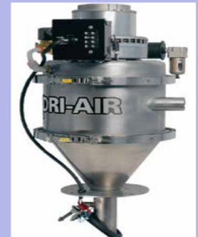
Integral hopper loader