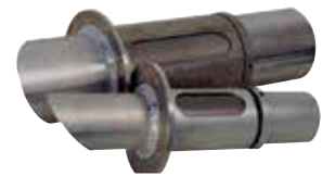
Material probes with adjustable air flow, 1.5" - 4" O.D.