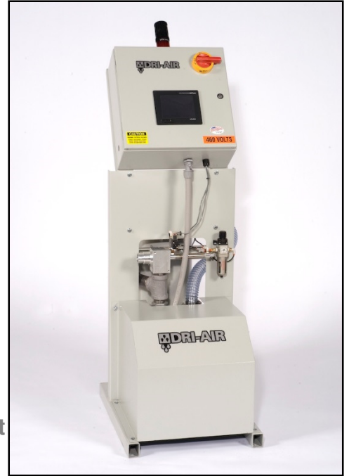
Central pump with filter & control panel

Sealed system keeps dust and fines in the filter and not through out your plant!