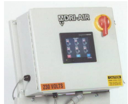
Color touch screen

From 1 station to 10, Dri-Air control panels will provide easy, straightforward operation for loading, hoppers, machines or blenders.