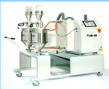
Shown with optional hopper loaders