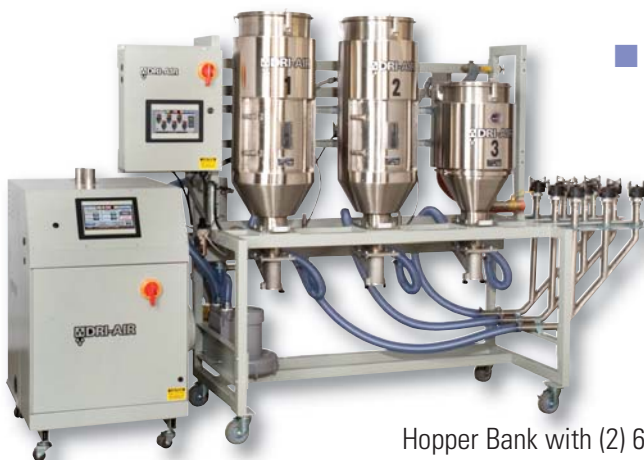
Hopper Bank with (2) 60 lb, (1) 30 LB. hopper and closed loop conveyance to three molding machines